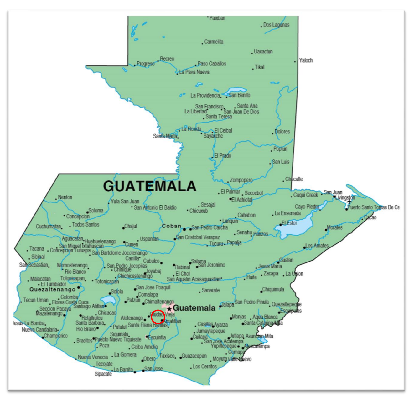
GPS Coordinates: 14° 32′ 29.6″ N, 90° 39′ 07.3″ W