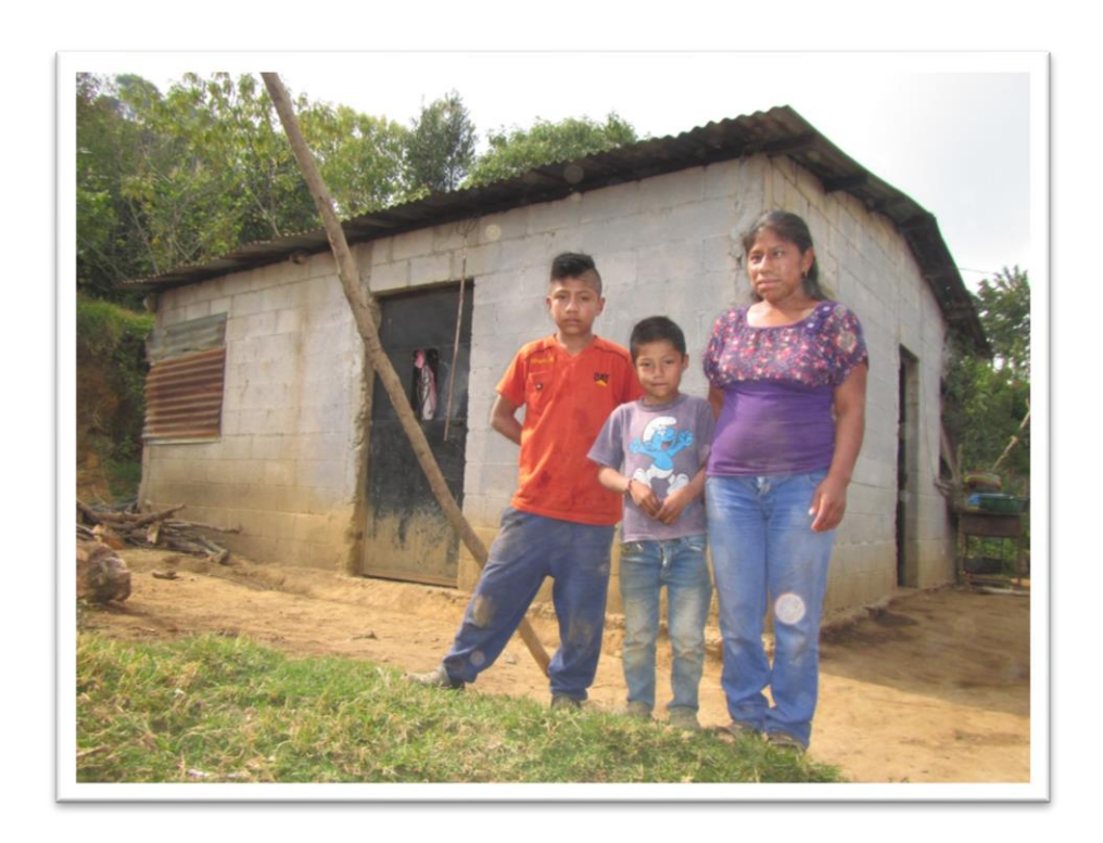
These unfinished homes will be repaired.

Their home was built by the government over 10 years ago and has been left unfinished.