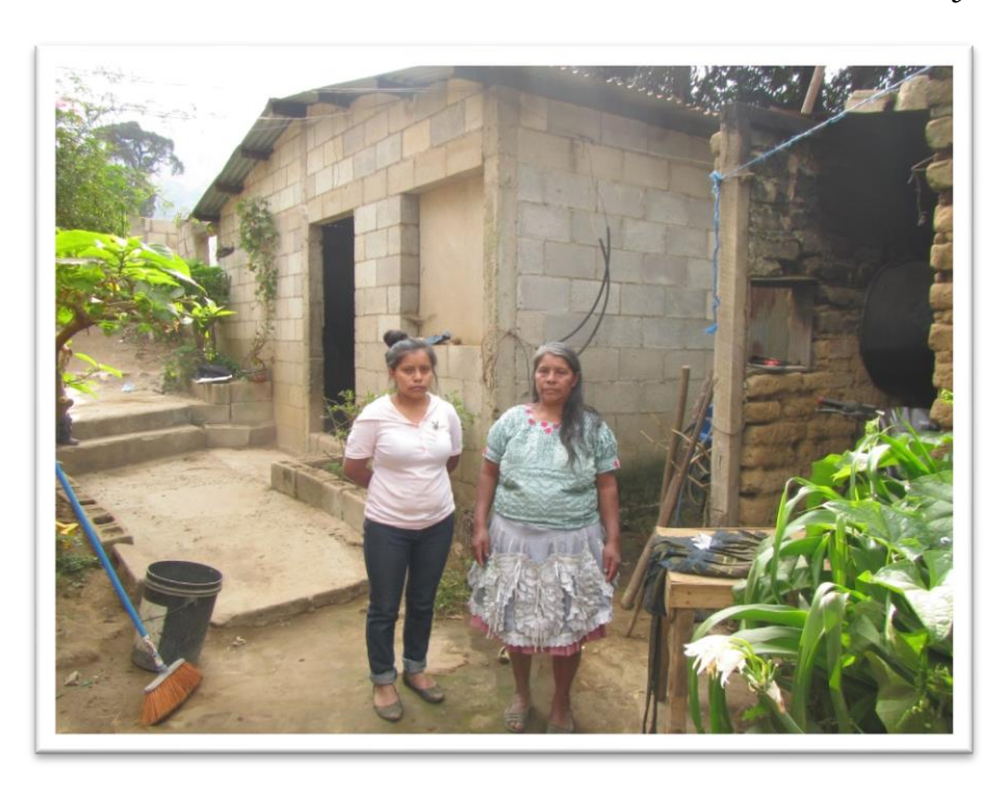
Left unfinished by the government, their roof will be replaced and the home will be freshly painted.