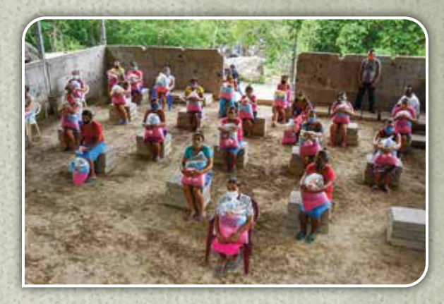
Mothers in Nicaragua receive packages of aid including blankets, oil, rice and beans, and hygiene kits at a COVID-19 community distribution site.