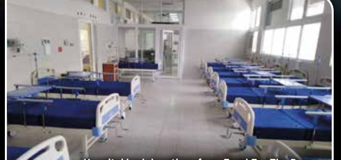
Hospital bed donations from Food For The Poor as seen at a local hospital in Tela, Honduras. "It is a blessing to be able to support the health of our country in these crucial moments." - Linda Coello, President, CEPUDO