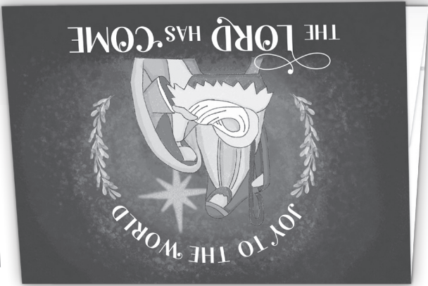
Free Gift Card

"Whatever you did for one of the least of these brothers and sisters of Mine, you did for Me." (Matthew 25:40, NIV)