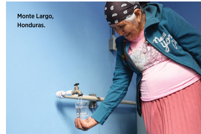
Monte Largo, Honduras.