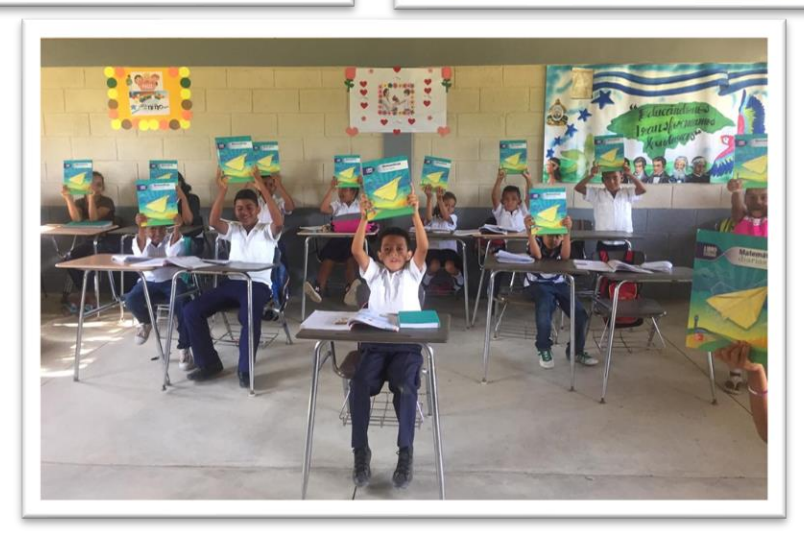
"Children are indeed a heritage from the LORD, and the fruit of the womb is His reward." Psalm 127:3